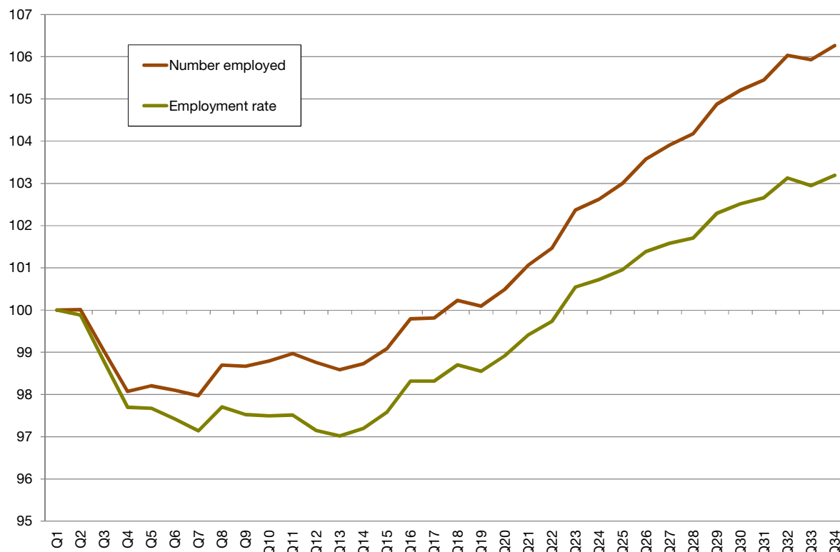
Chart 1: Working age employment and employment rate over time (Q3 2008 = 100)